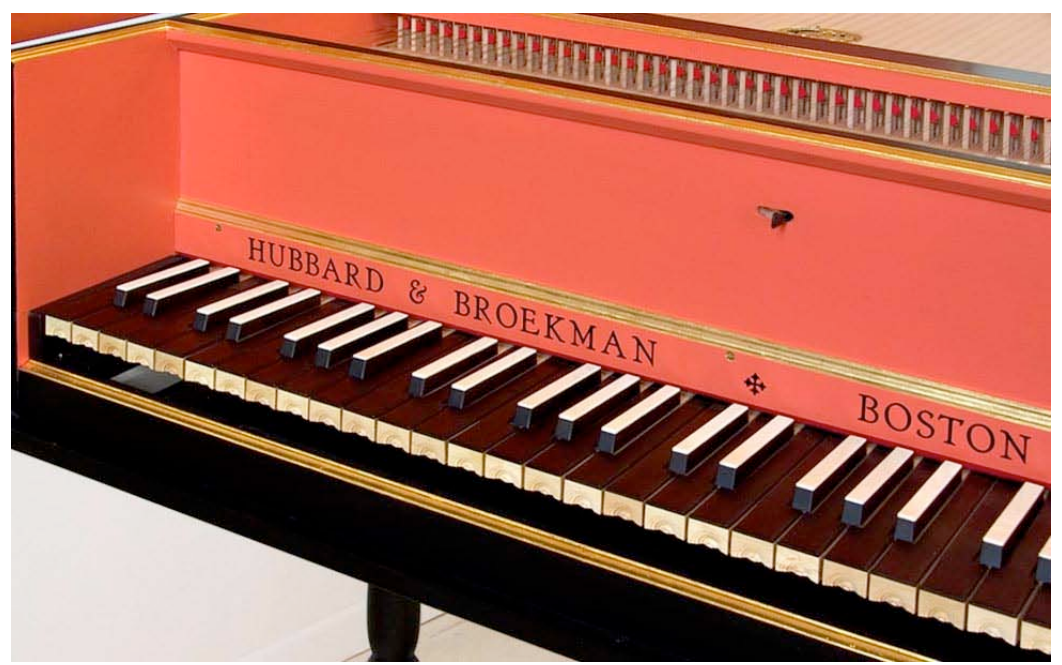
18th c. French-style keyboard is comfortable to play with reproduction wood jacks

The layout and touch of the keyboard is that of the 18th century originals from which the design was derived. The keys are rear-guided by pins running in an unbushed wooden rack at the rear of the keyboard and painstakingly balanced for evenness of touch. The octave span is 6 1/4" and the natural key heads are 1 3/8" long, conforming to 18th century French practice. Key fronts are decorated with wood arcades (pear or box, as available), the ebony key heads are rounded and scored with decorative lines, and the stained hardwood, bone-topped sharps are tapered in height and width. The jacks are meticulous reproductions of 18th century French jacks manufactured from the correct woods. Tongues can be furnished pierced for Delrin or feather plectra with return springs of either Nylon or hog bristle. Hubbard Delrin jacks may be substituted. It is close attention to details such as these that results in the light, reliable and, above all, comfortable action favored by 18th century composers and players – one that these instruments possess.