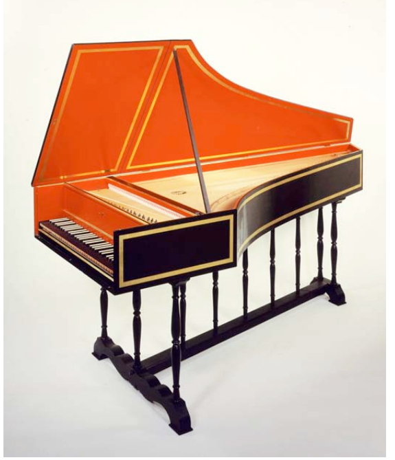
Flemish single-manual harpsichord á petit ravalement

The instrument possesses two choirs of strings at eight-foot pitch ( 2 \times 8' ). The design allows for transposition