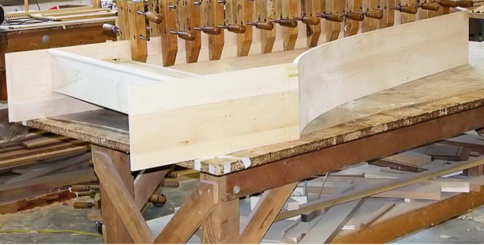
A sturdy bench and lots of clamps ease the task of assembling one of our kits.

Builder's Workshops cost $125 per day. Multiple participants are welcome.