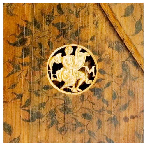
IM rose and soundboard painting on 1584 single-manual harpsichord

The Hubbard large 16th century Flemish single-manual harpsichord is patterned on an instrument built in Antwerp in 1584 by Hans Moermans. Frank Hubbard was able to purchase the original from a private collection in Belgium in the 1960's. It is one of the few surviving instruments to carry the Moermans name. At the time he was producing the drawings to which this design is still made, Frank Hubbard had the incredible luxury of having only to turn around from the drafting table to consult or measure the