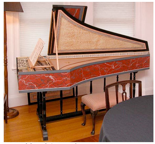
Hubbard & Broekman Boston 2002, at home [Watertown, MA]

Range: 55 notes, GG/BB-f"', chromatic up from E, non-transposing, maximum pitch a' = 415 Hz Disposition: 1 x 8', buff stop, 1 x 4'; registers project through cheek Dimensions: length 6' 11"; width 2' 10" Instrument weight (exclusive of stand): 100 lbs Shipping weight: 310 lbs. crated