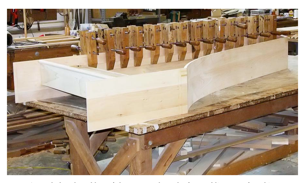
A sturdy bench and lots of clamps ease the task of assembling one of our kits.

Builder's Workshops cost $125 per day. Multiple participants are welcome.