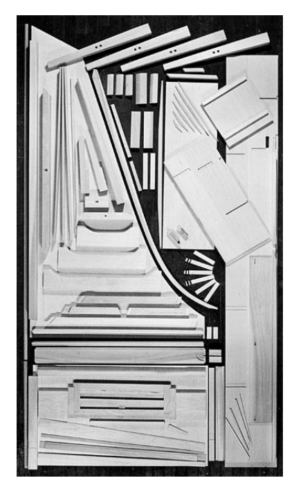
Pre-cut French double kit shown as example (above, left)

All wooden parts are made in our shop from the highest quality woods, selected for appropriate structural soundness, consistency, and density. All parts are accurately dimensioned and shaped, with miters, dadoes, rabbets and mortises cut and joints prepared for gluing where appropriate. The wrestplanks are given particularly careful attention to ensure their suitability and longevity. We drill the wrestpin holes in each wrestplank using a proven metal template - a very important feature. Decorative mouldings are cut into all appropriate parts. Critical joints are tested and handadjusted for precise fit just before the kit is packed. The kit contains all materials needed to make a complete instrument, including the lid, flap, lid stick, music desk, fallboard, decorative papers and rose - everything except paint! In addition we include a full set of tuning and voicing tools to help make the job of musical finishing easier.