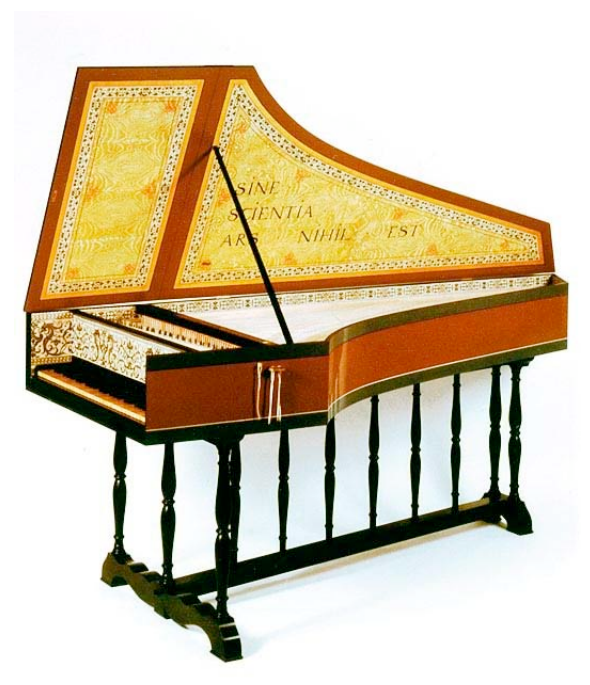
Frank Hubbard Boston 1974

The construction and balancing of the keyboard are identical to the original. The key motion is limited both by a rear over rail and by the jack rail. The keyboard has an octave span of 6 9/16" and is furnished with bone natural key coverings scored and rounded in the Flemish manner. The key fronts are decorated with a hand-carved gothic motif. The jacks are meticulous reproductions of 17th century Flemish jacks manufactured from the correct woods. Tongues can be furnished pierced for Delrin or feather plectra with return springs of either Nylon or hog bristle. Hubbard Delrin jacks may be substituted. It is close attention to details such as these that results in the light, comfortable and reliable action favored by 17th century composers and players – one that these instruments possess.