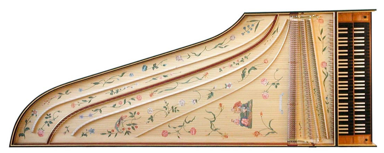
Large Harpsichord (Aston, PA) with German-style soundboard painting. The central tableau is of Apollo serenading Diana, the huntress – an allegory of the palliative power of music (Barbara Pixton, artist)

with the wrestplank and header pegged through the exterior of the case. These expensive and worthwhile features will later be seen shadowed in the painted finish. The wrestplanks are maple. The soundboards are made from either European or Eastern white spruce and the bridges and nuts are beech. The standard turned-leg trestle stand, similar to an original Hass stand, is relieved on top to contact the bottom of the instrument only over